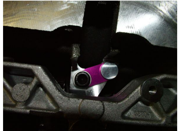
Fig. 1 - BSD Installed