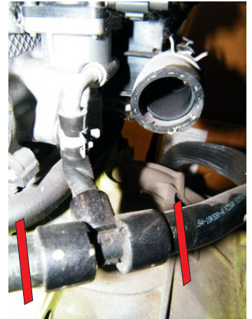
Fig. 5 Late model molded T. Cut at red lines