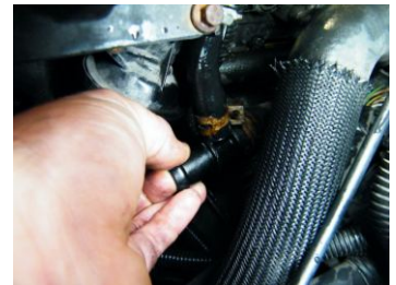
Fig. 3 Removing T Fitting