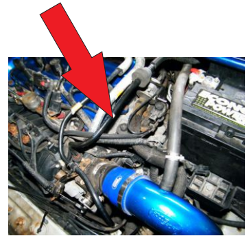
Fig. 1 OEM EGR Valve