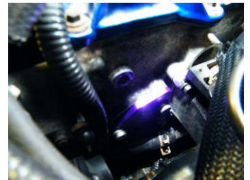
Fig. 6 Install plate