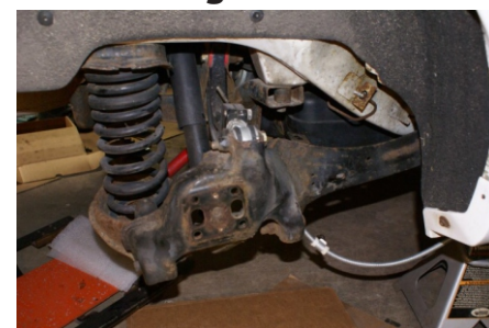
Fig. 5 Bare Arm