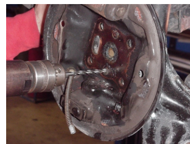
Fig. 2 Drill rivets