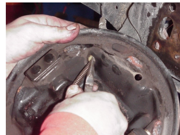
Fig. 3 E brake cable