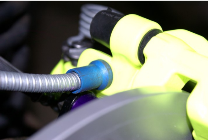
Fig. 13 Cable pushed into caliper