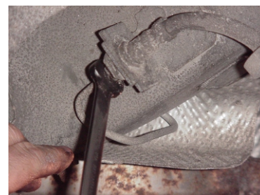
Fig. 4 Hoses