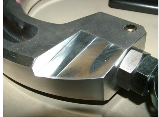
Fig. 2 Notched for shock clearnace