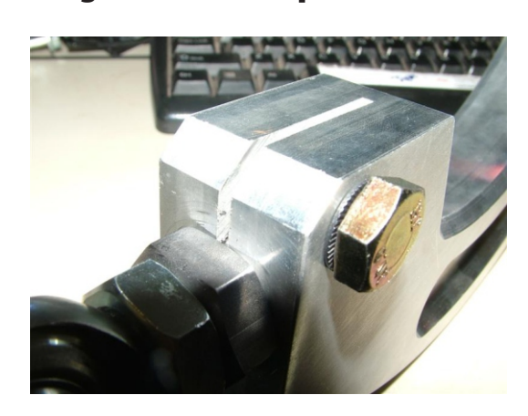
Fig. 7 Pinch Bolt

Massive = Focus Performance Pros!!! Contact us for ANY Focus need!