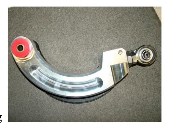
Fig. 4 Duplicating OE length