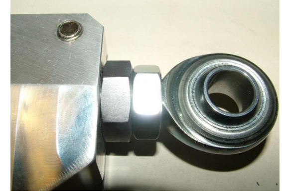
Fig. 3 Starting position

Massive = Focus Performance Pros!!! Contact us for ANY Focus need!