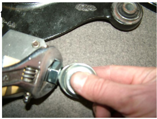
Fig. 5 Hold end Adjust Sleeve