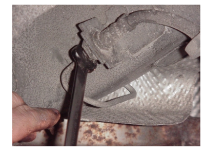
Fig. 4 Hoses