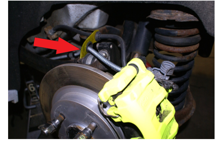
Fig. 12 Cable/ hose bracket