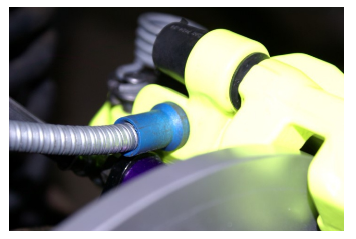
Fig. 13 Cable pushed into caliper recommended). Torque to 85 Ft lbs). • Attach brake hose to chassis side tube nut using 7/16" tubing wrench (11 ft lbs). Be sure to reuse retaining clip. (Fig. 15) •Push hose's grommet into brake hose / cable locating bracket.