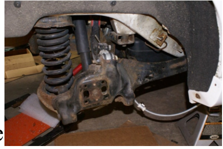
Fig. 5 Bare Arm