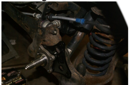
Fig. 6 Sandwich bracket