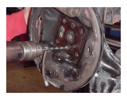
Fig. 2 Drill rivets

new hub. This can be done carefully with a screw driver or 3 jaw puller. Alternatively, new rings can be purchased (part number on last page). Be sure to check clearance between sensor and tone ring! You may need to space back sensor with an M6 flat washer should there be any contact.