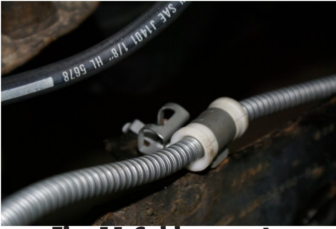
Fig. 11 Cable mount