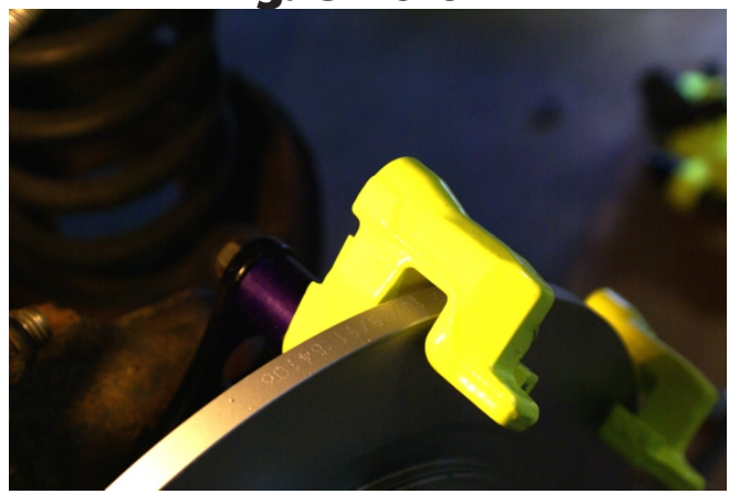
Fig. 9 Bracket w/ spacers