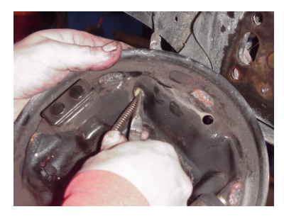
Fig. 3 E brake cable