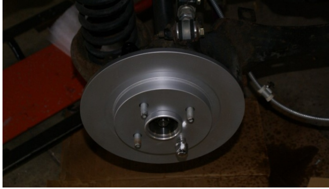
Fig. 8 Rotor