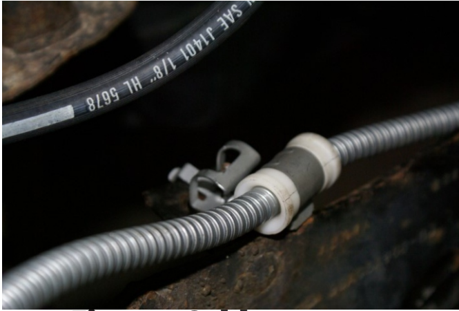
Fig. 11 Cable mount