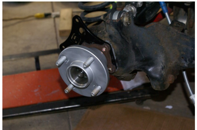
Fig. 7 Hub

•Remove upper camber arm bolt. Install new zinc plated cable/hose bracket on side of trailing arm facing front of vehicle, orient straight up, re install bolt (anti seize