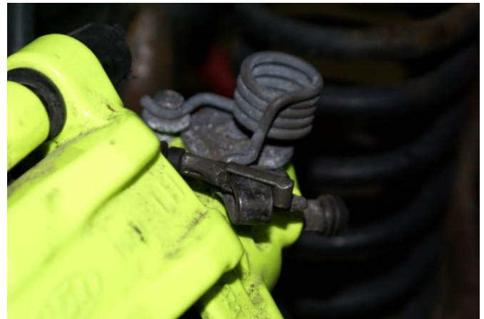
Fig. 14 Cable clipped to lever