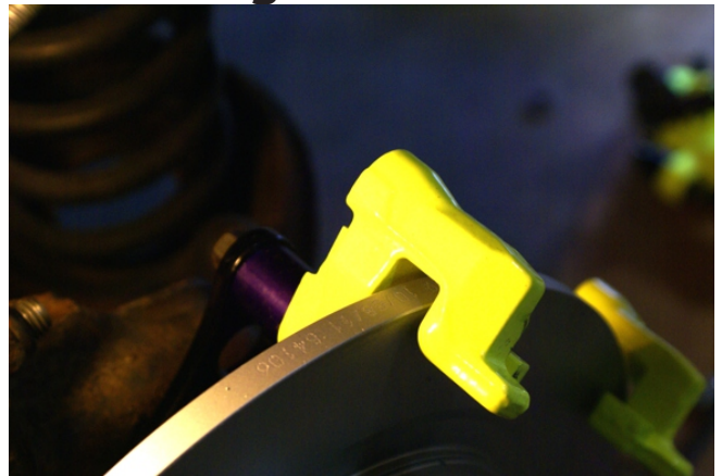
Fig. 9 Bracket w/ spacers