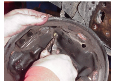
Fig. 3 E brake cable