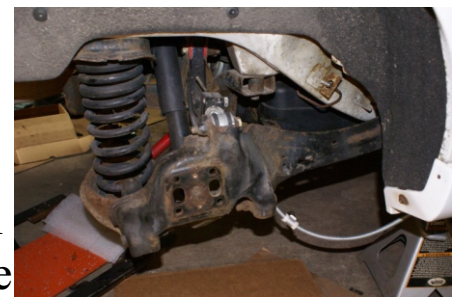
Fig. 5 Bare Arm