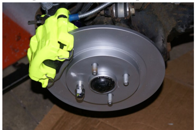
Fig. 10 Caliper w/ anti rattle clips