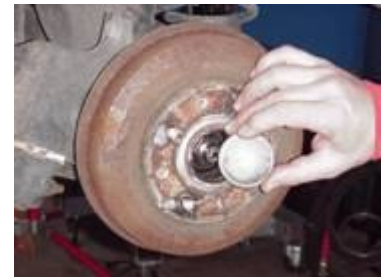
Fig. 1 Dust Cap

Massive = Focus Performance Pros!!! Contact us for ANY Focus need!