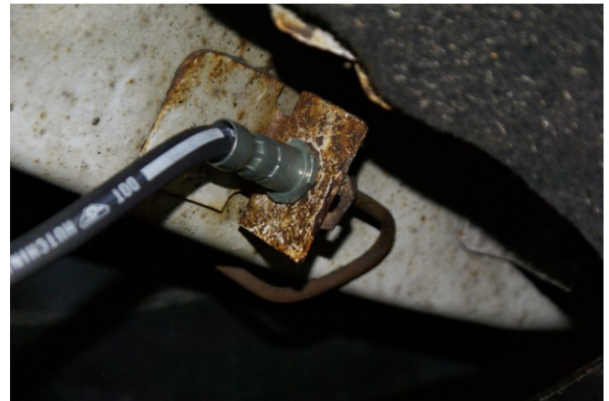
Fig. 15 Hose the chassis, clip installed

Massive = Focus Performance Pros!!! Contact us for ANY Focus need!