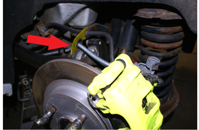
Fig. 12 Cable/ hose bracket