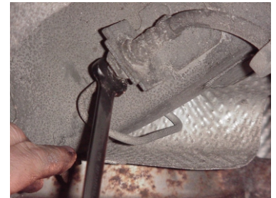
Fig. 4 Hoses