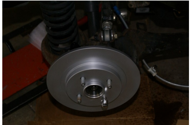
Fig. 8 Rotor