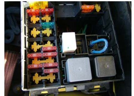
Fig. 2 Jumper Installed into R13