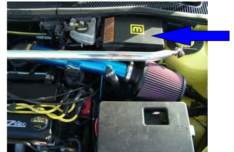
Fig. 1 Fuse Box Location