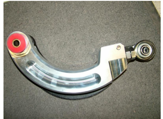
Fig. 4 Duplicating OE length