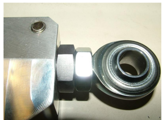
Fig. 3 Starting position

Massive = Focus Performance Pros!!! Contact us for ANY Focus need!