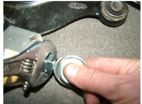
Fig. 5 Hold end Adjust Sleeve