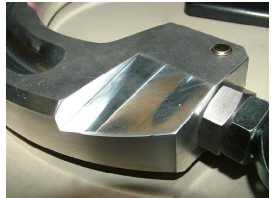
Fig. 2 Notched for shock clearance