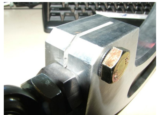
Fig. 6 Pinch Bolt

Massive = Focus Performance Pros!!! Contact us for ANY Focus need!